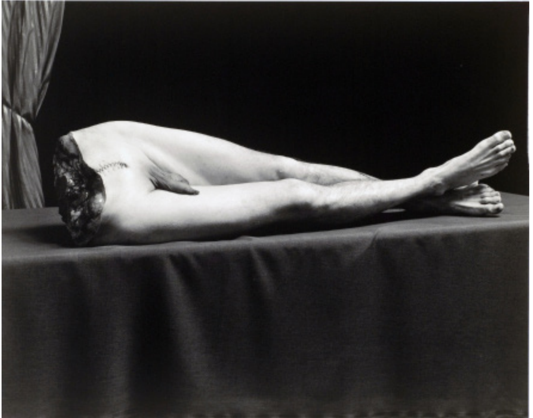
Joel-Peter Witkin, Corpus Medius , 2000