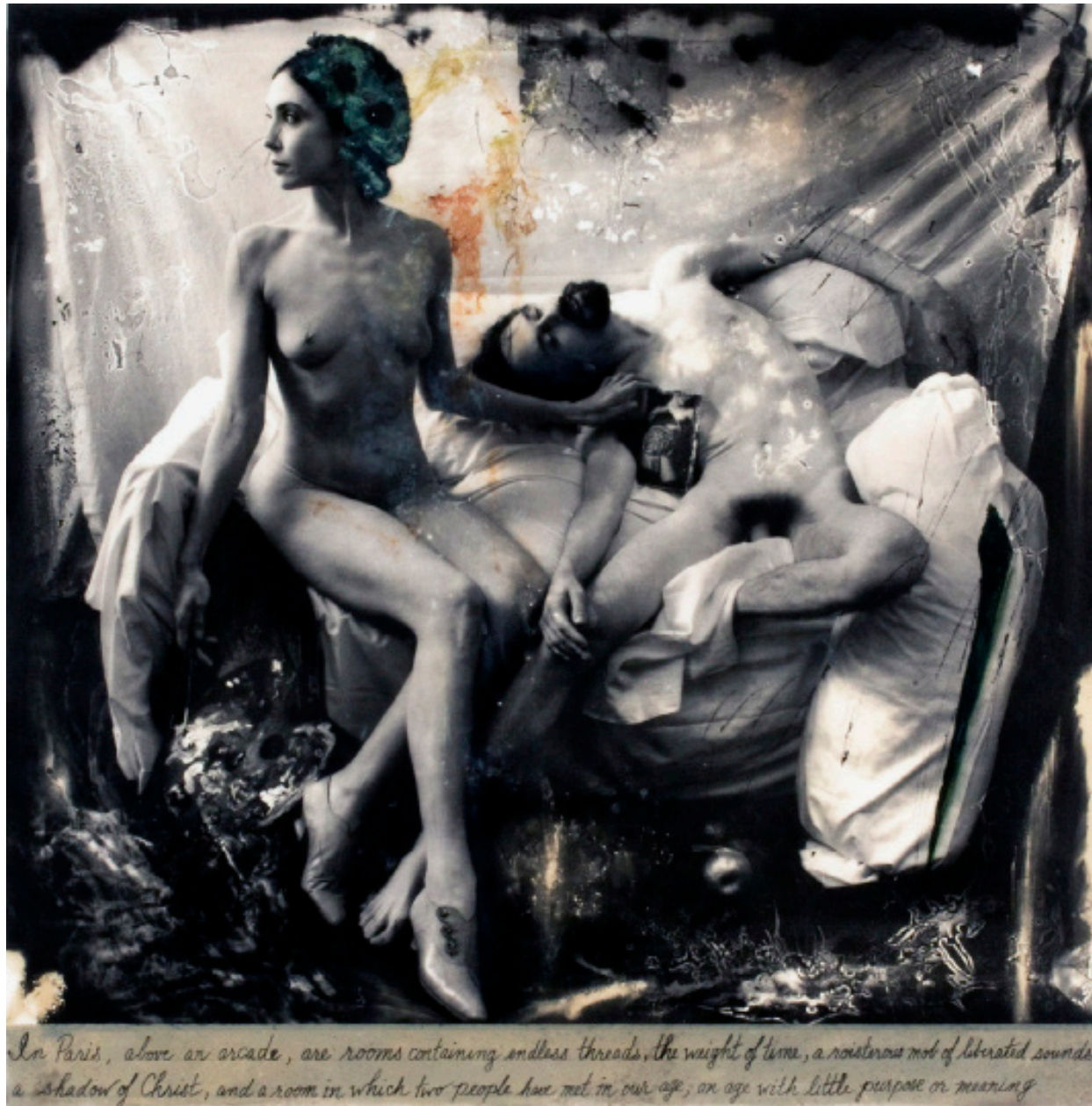
Joel-Peter Witkin, Above the Arcade, 2013