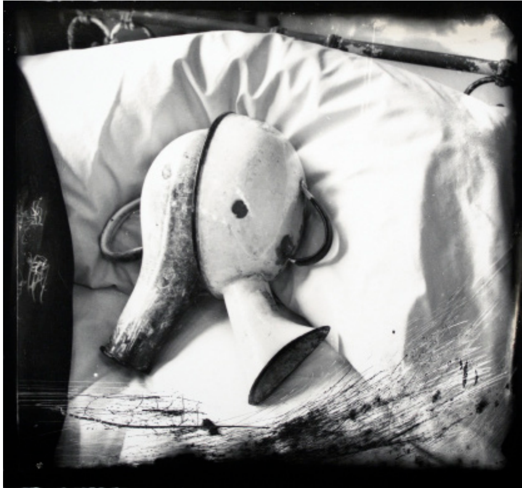
Joel-Peter Witkin, Love in Post-Modern Oblivion, 2011