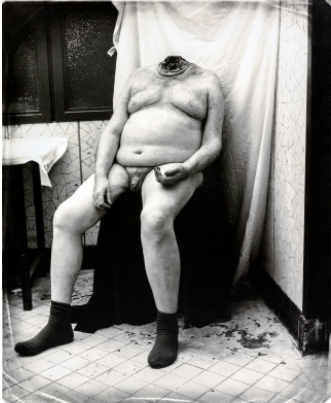
Joel-Peter Witkin, Man Without a Head, 1993