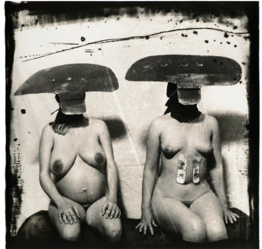
Joel-Peter Witkin, Photograph from Purgatory- Two Women with Stomach Irritations, 1982