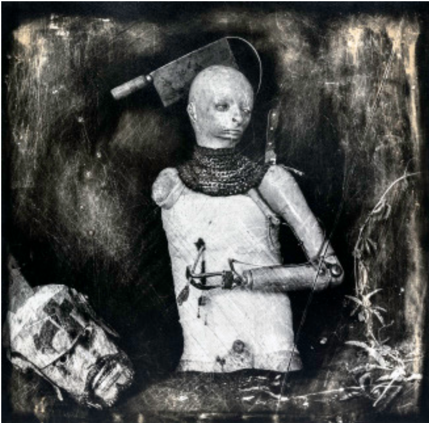
Joel-Peter Witkin, Un Santo Oscuro , New Mexico, 1987