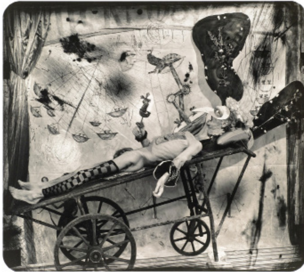
Joel-Peter Witkin, The Aleph , 2001