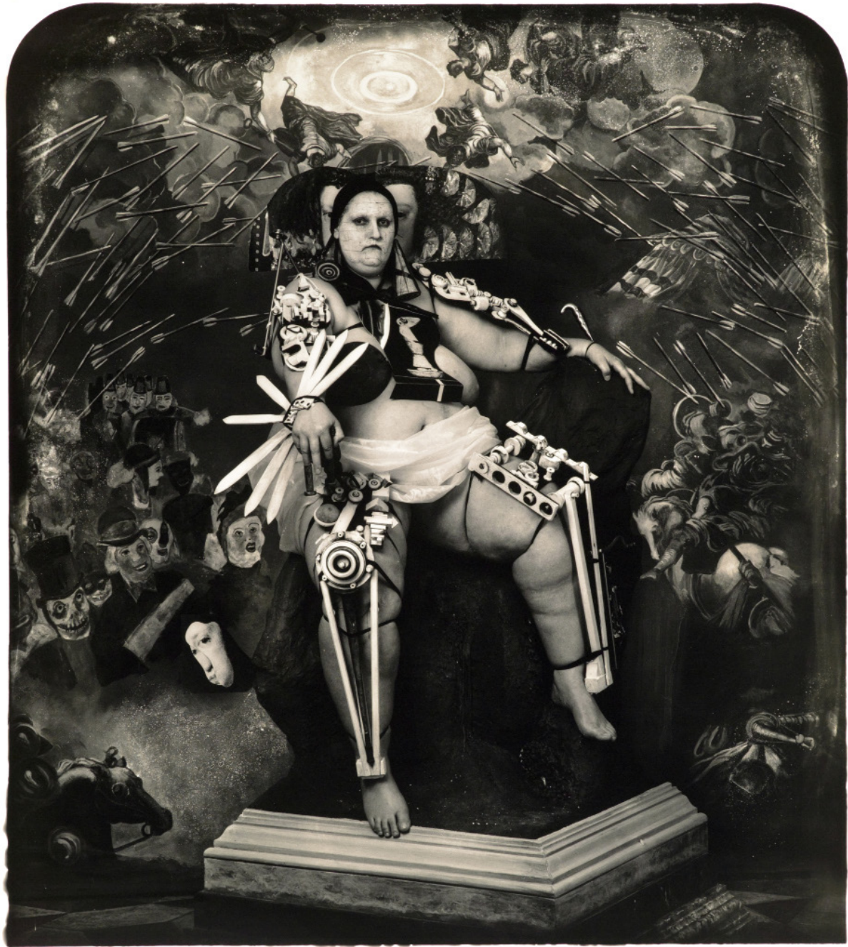
Joel-Peter Witkin, Female King, 1997