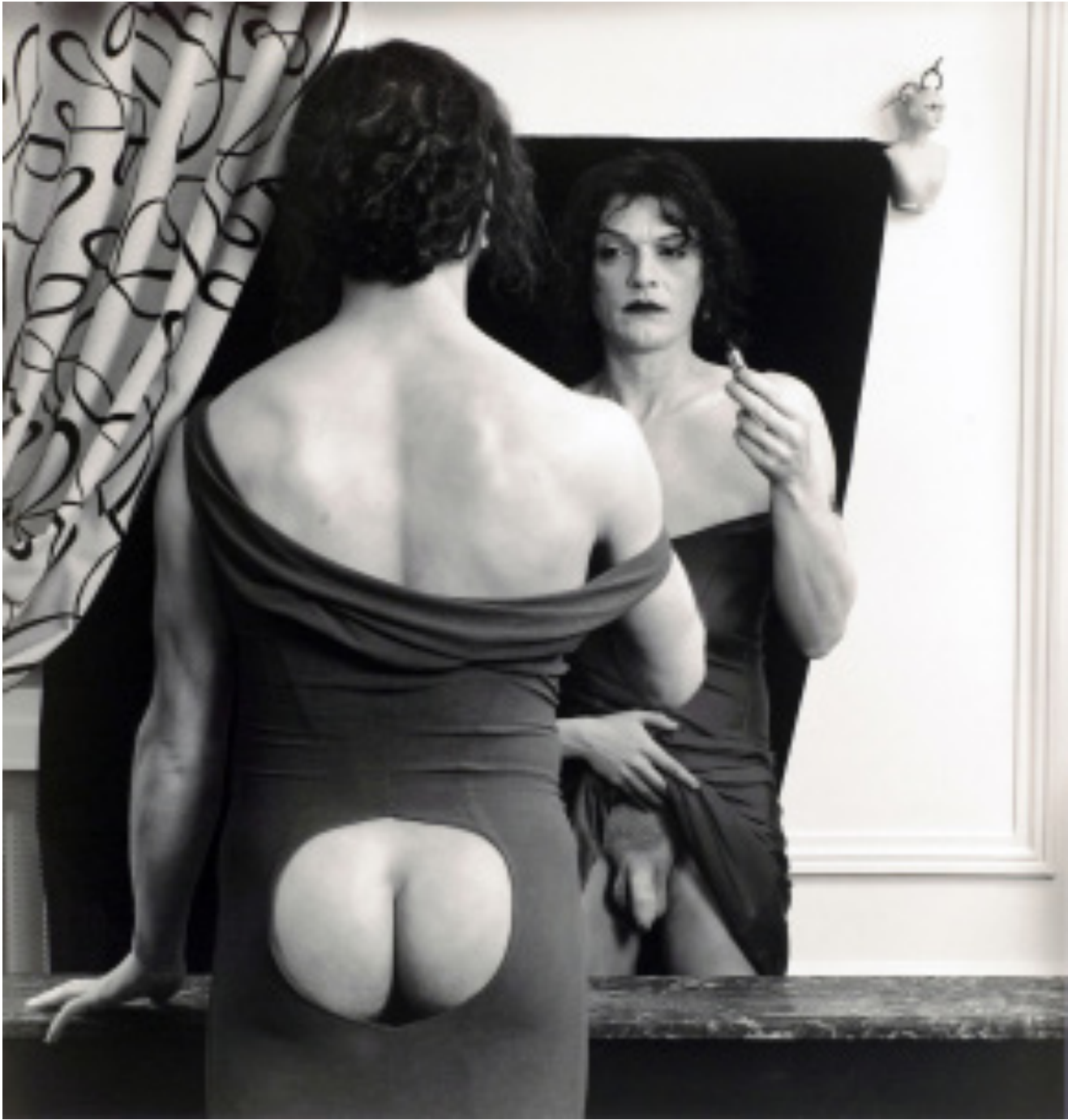
Joel-Peter Witkin, Man Reflected, Paris, 2007