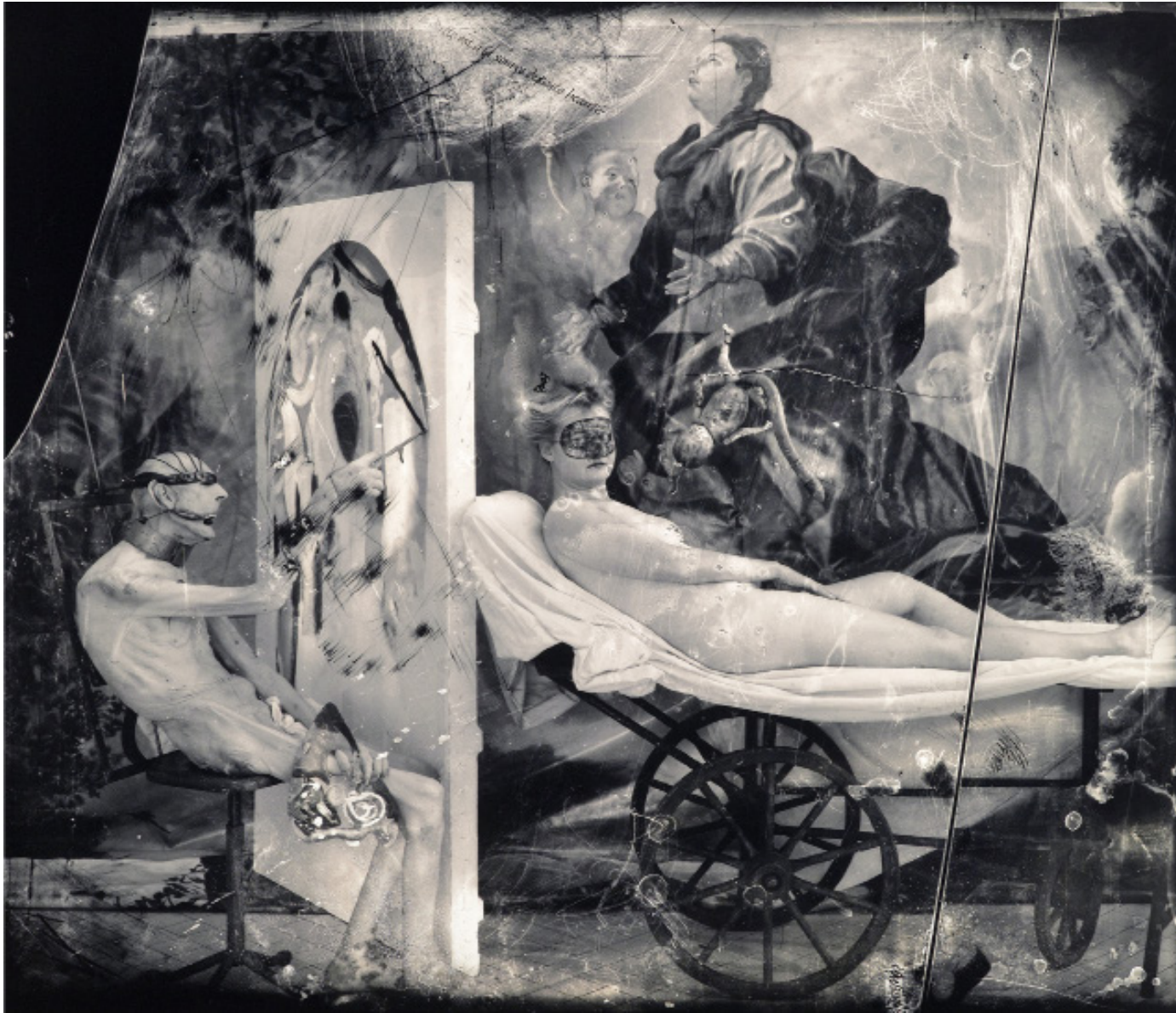
Joel-Peter Witkin, Poussin in Hell, 1999