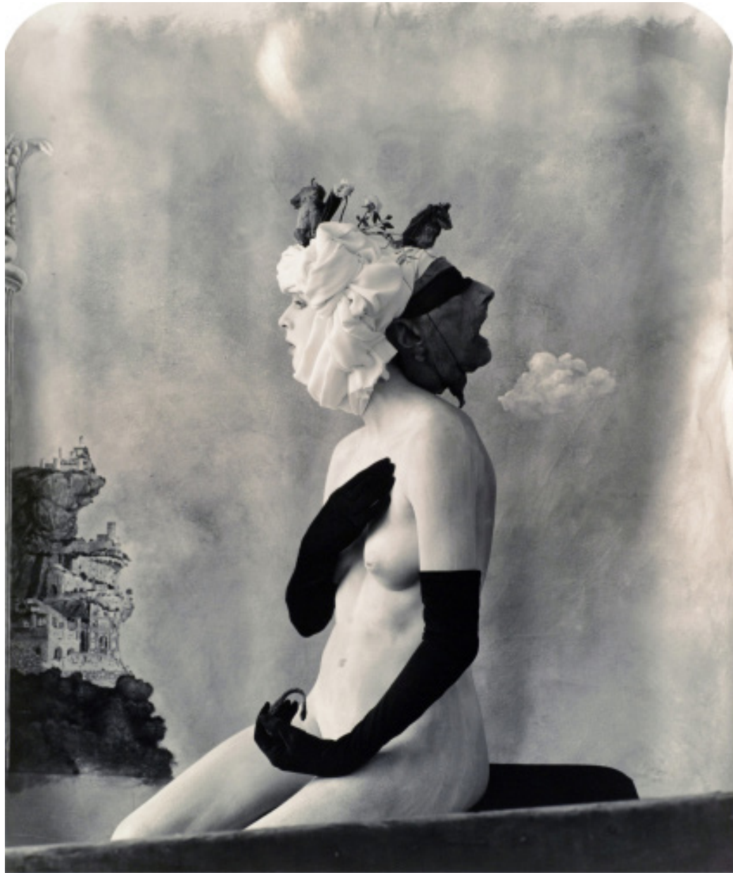
Joel-Peter Witkin, Prudence, Paris, 1996