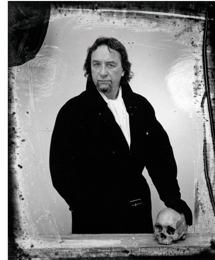
Joel-Peter Witkin, Self Portrait,

J oel-peter witkin is renowned as the creator of elaborately-staged and often erotically charged tableaux exploring grand themes of religion, sex and mortality. His provocative and sometimes dark imagery is frequently populated by people marginalized by society including dwarves, persons with extraordinary physical attributes and deformities, hermaphrodites, and other “outsiders,” and created a sensation when first shown in early 1980s at the Stedelijk Museum, Amsterdam, and at the San Francisco Museum of Modern Art.