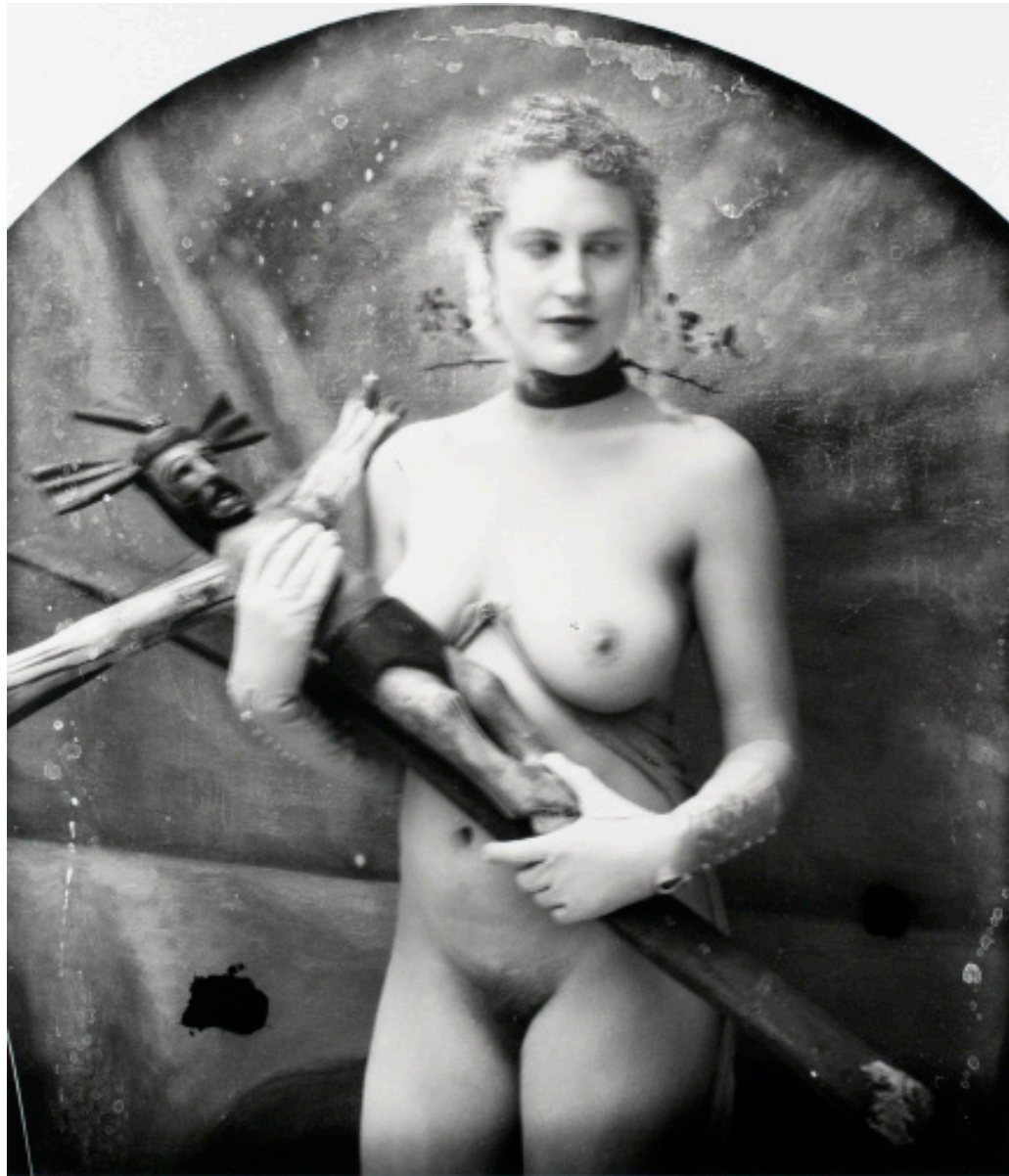
Joel-Peter Witkin, Presenter of the End of Time Awards, 2013