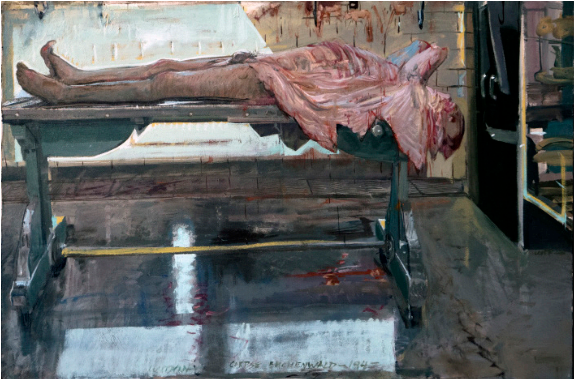
Jerome Paul Witkin, Table #7, Corpse, Buchenwald, 1945, 1991