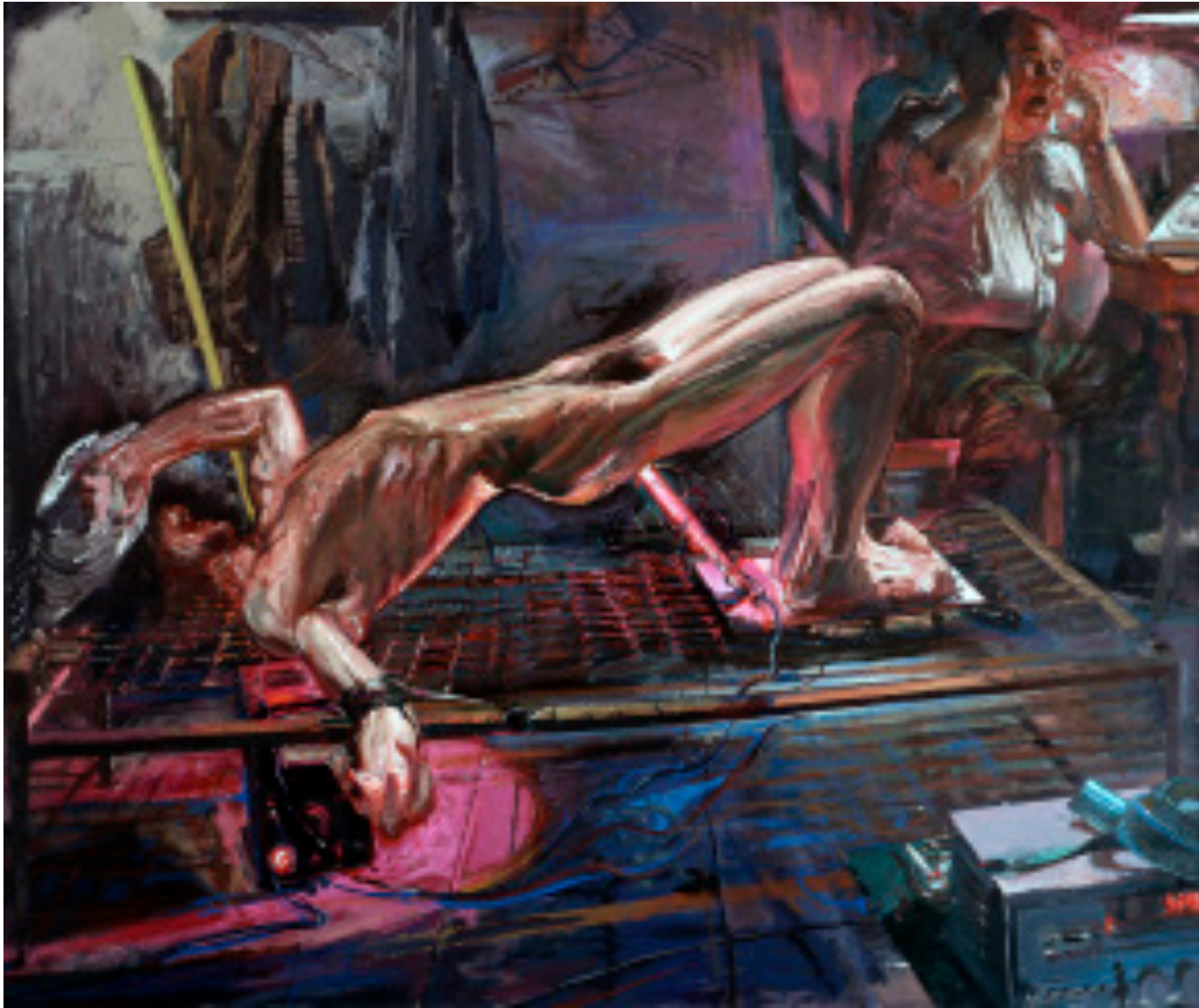
Jerome Paul Witkin, Unseen and Unheard (in Memory of All Victims of Torture) , 1986